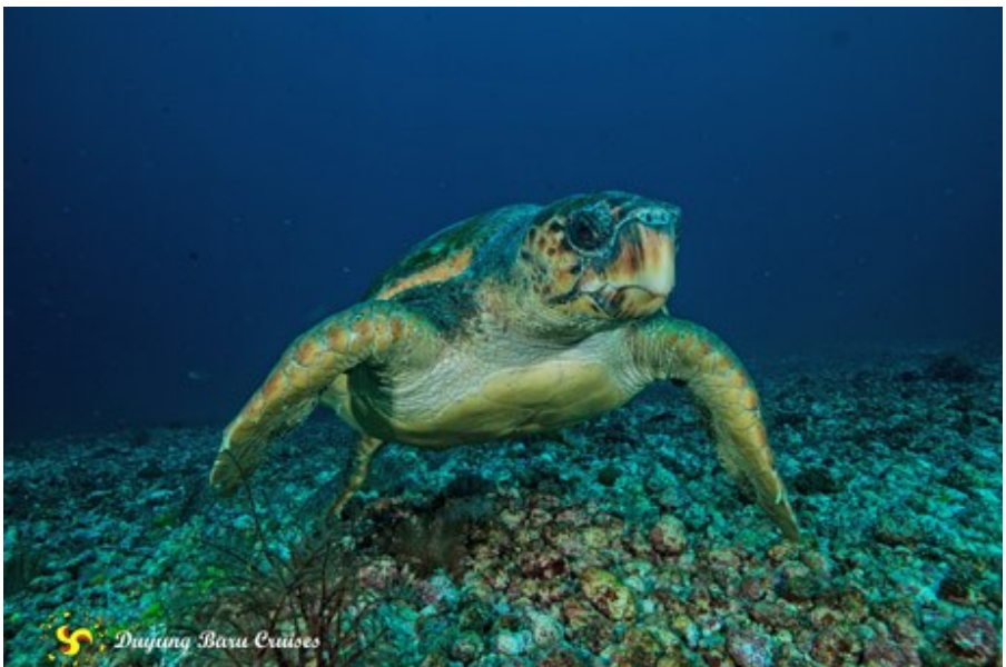
Big Hawksbill Turtle in Manta Alley, Photo credit: Vovo Korth

Two double cabins and one twin cabin house the divers. There is plenty of storage space and ensuite shower and toilet. The beds are extremely comfortable. On the canopied deck are a sofa and chairs around a coffee table plus a sun terrace upstairs.