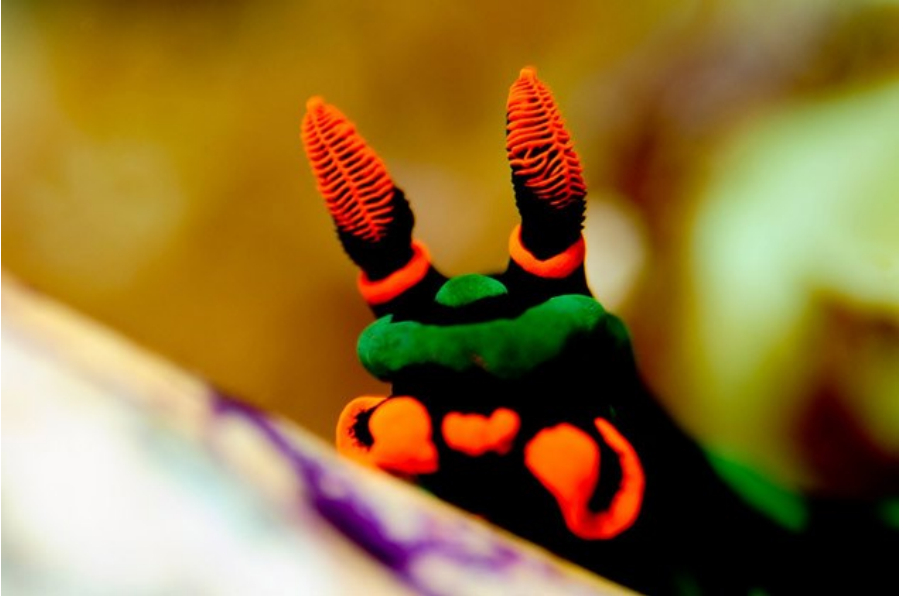
Nembrotha kubaryana nudibranch, Photo credit: Vovo Korth

The boat is only for experienced divers. Vovo likes you to have at least 75 dives. I would go further and say that you need to have experience of currents. The diving in many sites is not easy – the currents are fierce, especially at full and new moon (which is why there are so many large fish there). It is assumed you know what you are doing. At the beginning of the trip is an easy dive or two to practice using a SMB (surface marker buoy or “safety sausage”). Not until Vovo is satisfied that you can use the SMB will he take you on one of the the more challenging dives. That way if you should get separated from the group the tender will easily see you and pick you up.